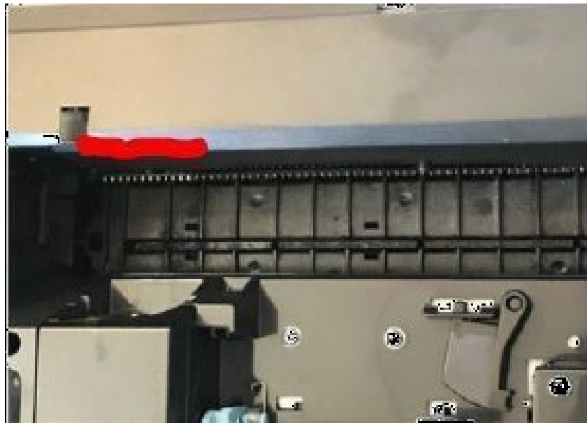
Figure 5. The contacts on the left-hand side have been cleaned to highlight what they should look like.

After you are done cleaning off the contacts with a cotton swab – take the erase side of a Number 2 pencil and go up and down each contact cleaning off any excess debris and or ink left over from the cotton swab.