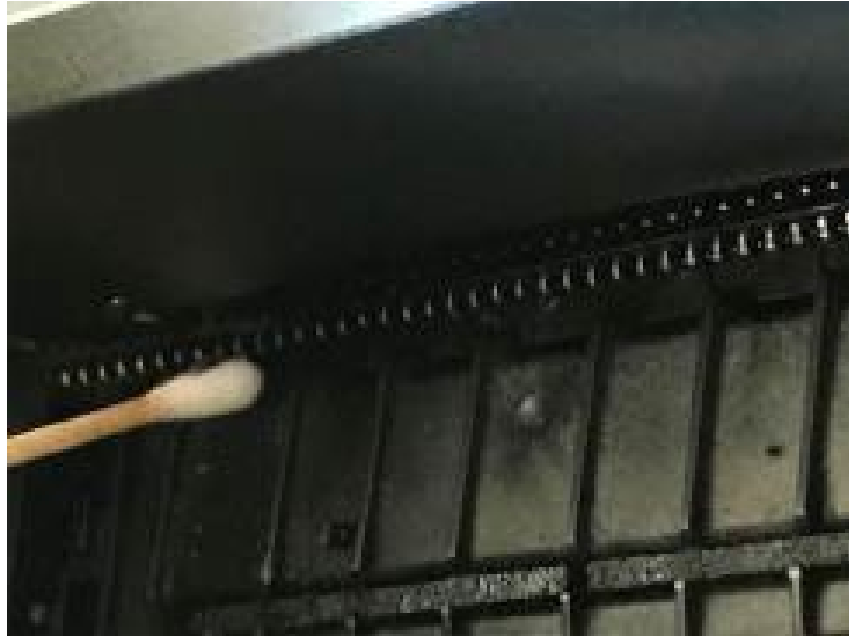
Figure 4. Gently cleaning off Pen PCA board contacts with a cotton swab and a little rubbing alcohol.

Utilizing a cotton swab or cloth with a little rubbing alcohol on the tip – gently go up and down each contact on the Pen PCA board. This will clear off debris and ink that may have accumulated over time. While wiping off the contacts be sure not to snag the cloth on the gold contact.