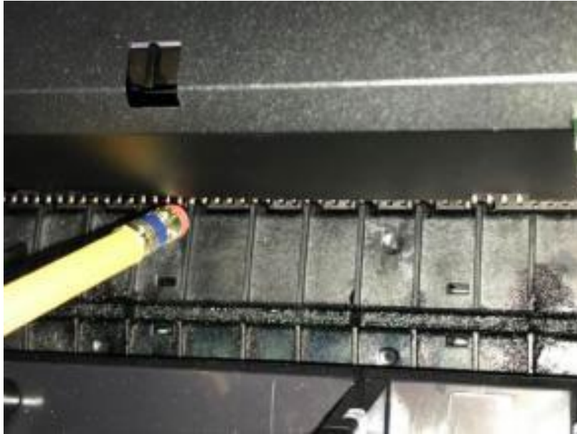
Figure 6. Cleaning of the Pen PCA board contacts with a Number 2 pencil.