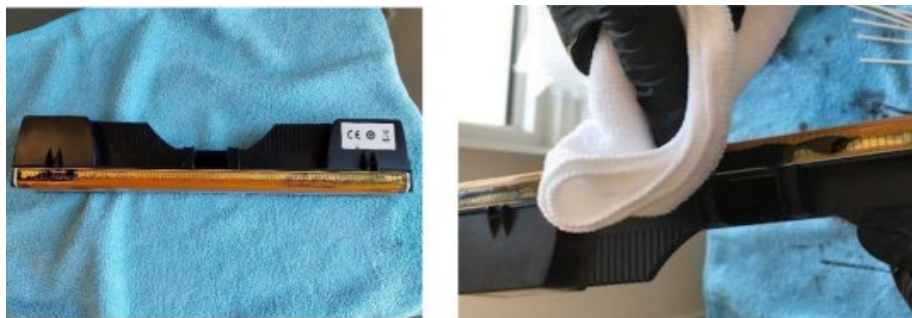
Figure 1. Wiping printhead contacts clear of debris with a dampened microfiber cloth with distilled water.

After ejecting the printhead from the machine set it down safely off to the side on a lint free cloth. Make sure to wipe any excess ink off the printhead contacts with distilled water and a cloth.