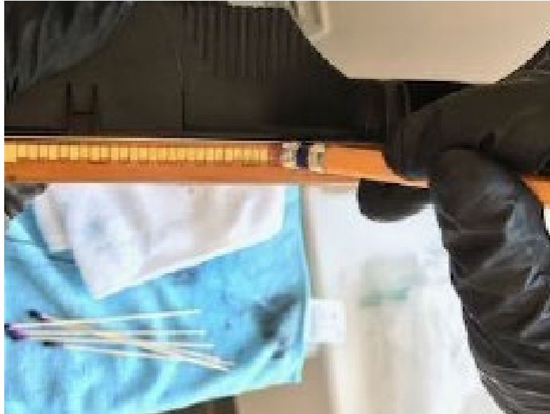
Figure 2. Using a Number 2 pencil clean the contacts off the printhead.

After cleaning the contacts off with a dampened microfiber cloth with distilled water. Now you can proceed by taking a number two pencils' eraser and gently rubbing each contact up and down.