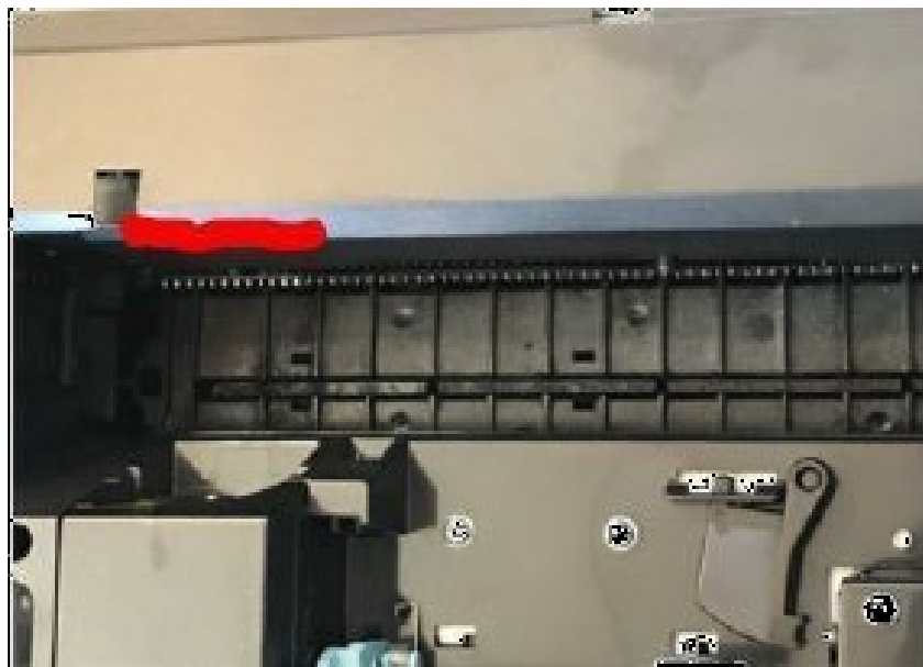
Figure 5. The contacts on the left-hand side have been cleaned to highlight what they should look like.

After you are done cleaning off the contacts with a cotton swab – take the erase side of a Number 2 pencil and go up and down each contact cleaning off any excess debris and or ink left over from the cotton swab.