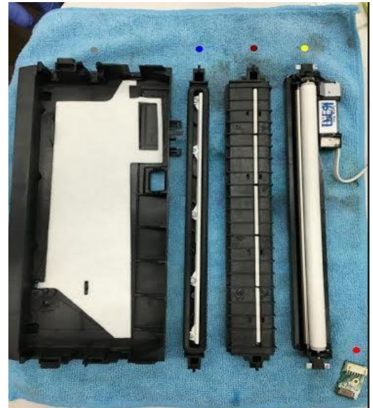
Figure 1: Service Station Components