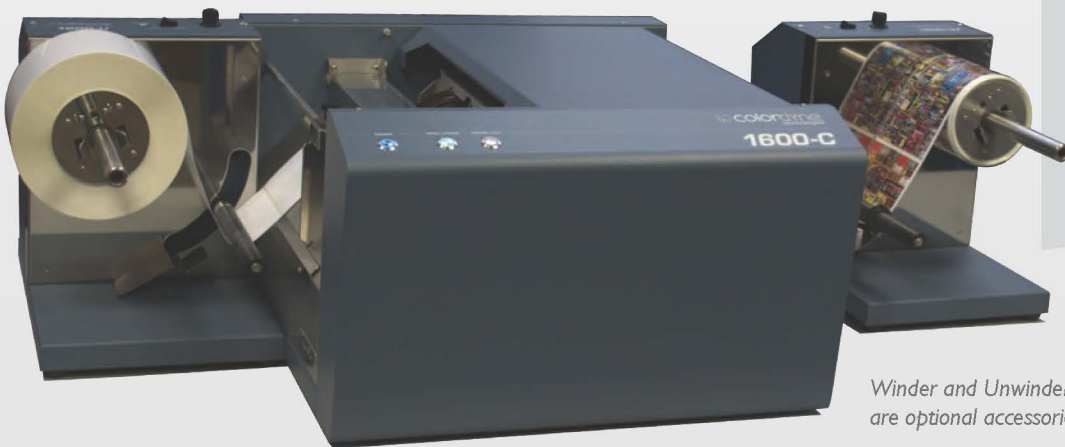
Winder and Unwinder are optional accessories

Join the Revolution in Affordable Color Digital Printing